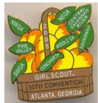
National Convention Patch